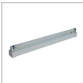
Corp fluorescent tip SS30 cu un tub D-170 - A Cod 019.010.190.001