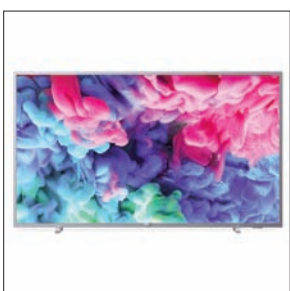
TV LED SMART 4K, UHD ultrasubtire (diagonala ecran: 126 cm) Cod 025 010 130 045