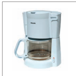
Filtru de cafea Cod 025.010.120.010