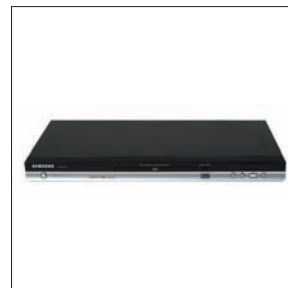
DVD Player Cod 025 010 130 030