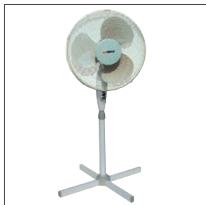
Ventilator cu picior Cod 025.010.500.020