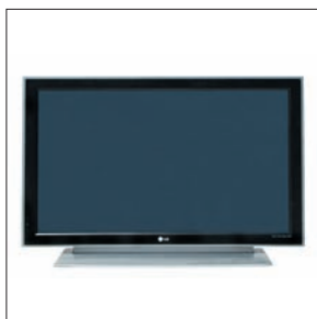
TV Plasma (diagonala ecran: 107 cm) Cod 025 010 130 040