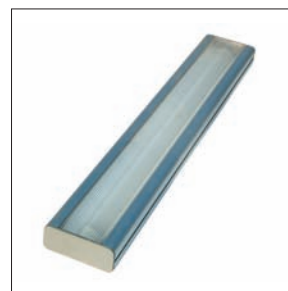
Corp fluorescent tip SYMA STAR Cod 019.010.200.001