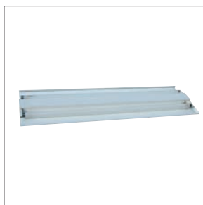
Corp fluorescent tip OCTANORM cu doua tuburi D-171 Cod 019.010.200.000