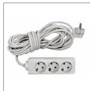
Prelungitor 230V, 10A, 5m Cod 019.010.279.000