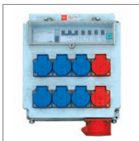
Panou Electric OCTANORM Cod 019.010.275.000