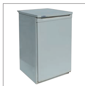
Frigider ARCTIC (180 l) Cod 025 010 070 020