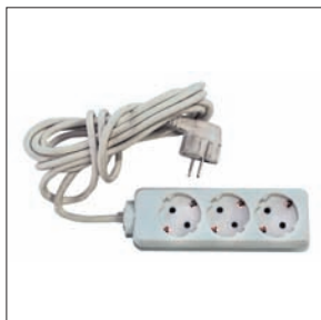
Prelungitor 230V, 10A, 3m Cod 019.010.277.000