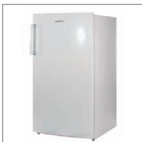
Frigider ARCTIC FB 155 Cod 025 010 020 198