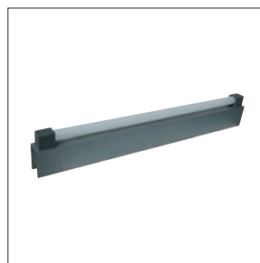
Corp fluorescent tip SS30 cu un tub D-170 Cod 019.010.190.000