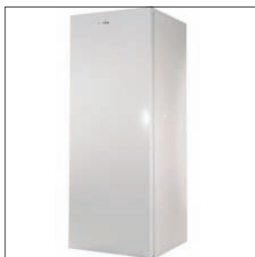
Frigider ARCTIC 255 l Cod 025 010 020 199