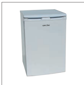
Racitor (140 l) Cod 025 010 070 010 (55 x 61 x 84 cm)