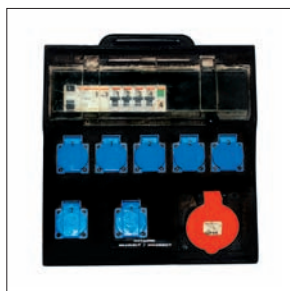
Panou Electric 380V/220V Cod 019.010.265.000