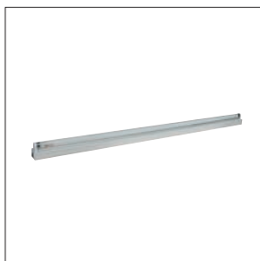
Lampa fluorescenta FIA cu instalatie electrica completa 1x40W Cod 019.010.110.000